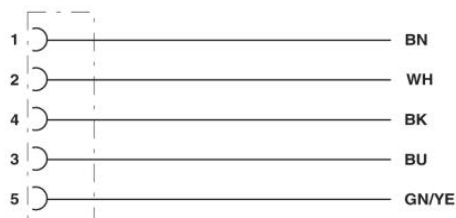
Contact assignment of the M12 sockets