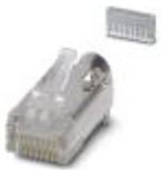
RJ45 pin insert, CAT5e, 8-pos., shielded, IDC connection method, for litz wires AWG 27 ... 26, with strain relief

RJ45 male insert - VS-08-ST-H11-RJ45 - 1652716