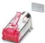
RJ45 male insert, CAT6, 8-pos., shielded, IDC displacement connection, for litz wire AWG 25 ... 24 and solid wires AWG 24, with strain relief

RJ45 male insert - VS-08-ST-H21-RJ45 - 1652729