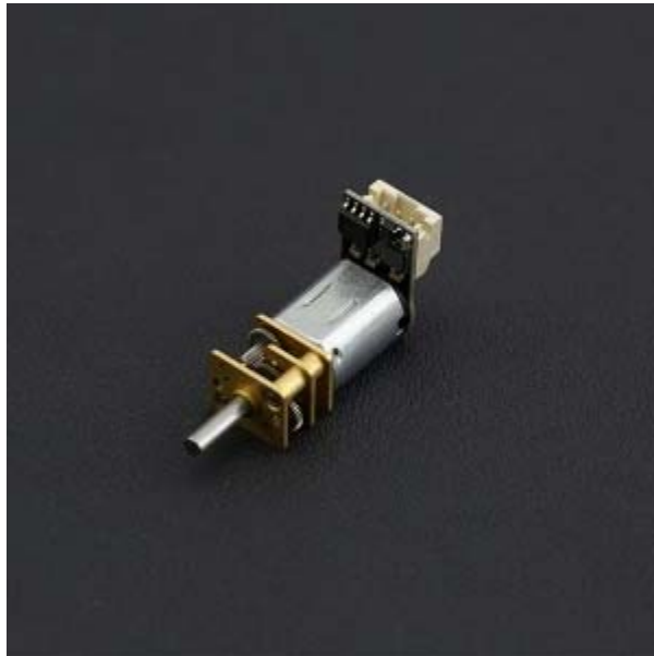
Micro Metal DC Geared Motor w/Driver