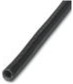
Galvanized steel protective hose with PVC coating

Protective hose - WP-STEEL PVC C 14 - 3240868