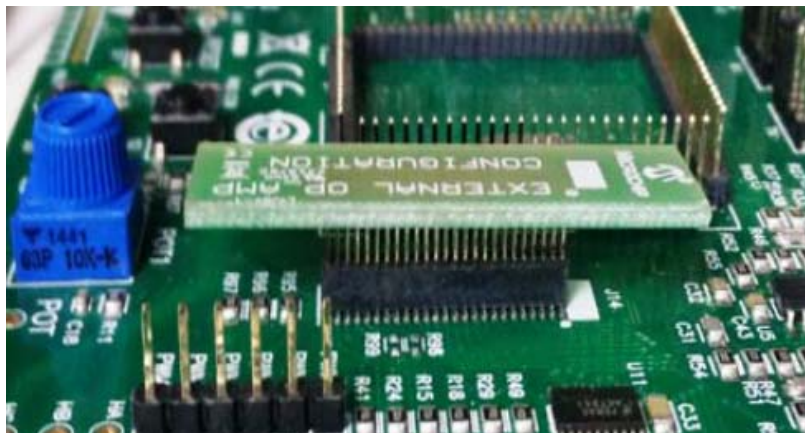
Figure 1. Op amp Configuration Board for dsPICDEM™ MCLV-2

For dsPICDEM™ MCHV-3 development board, insert PFC-EXT-OPAMP configuration board (included with the development board) at header J14.