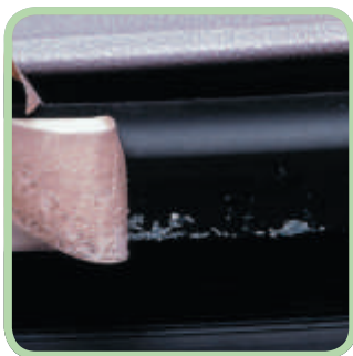
Minimize adhesive transfer on rubber moldings and painted surfaces.