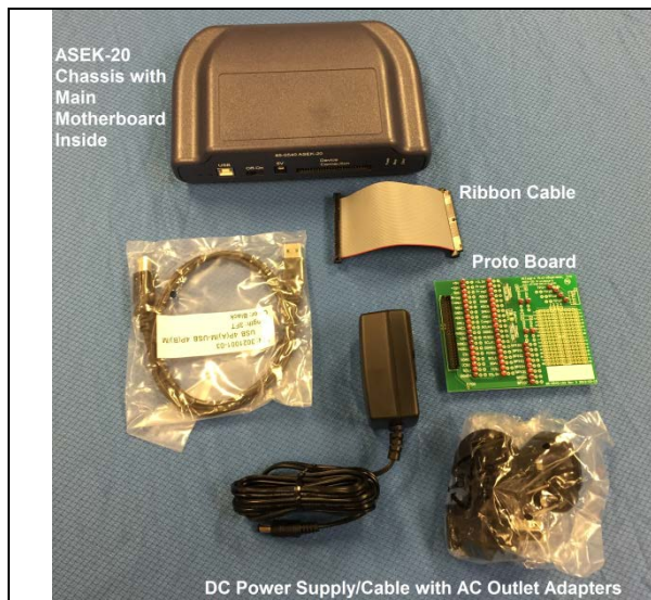
Figure 1. ASEK 20 Kit