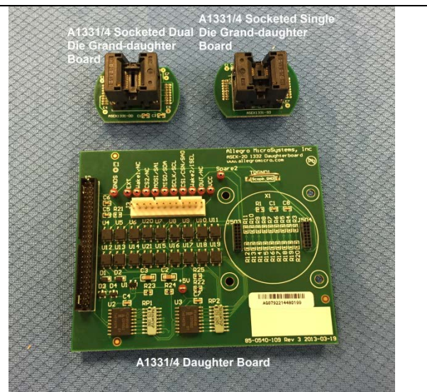
Figure 2. ASEK-1331-SUBKIT-T