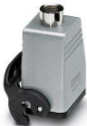
HEAVYCON coupling housing B6, with single locking latch, height 73 mm, with support 1x M20

Please be informed that the data shown in this PDF Document is generated from our Online Catalog. Please find the complete data in the user's documentation. Our General Terms of Use for Downloads are valid ( http://phoenixcontact.com/download )