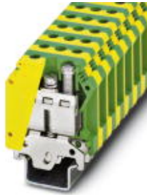
Ground modular terminal block, Connection method: Screw connection, Load current : 150 A, Cross section: 0.75 mm 2 - 50 mm 2 , AWG 18 - 2, Width: 15.2 mm, Color: green-yellow

Please be informed that the data shown in this PDF Document is generated from our Online Catalog. Please find the complete data in the user's documentation. Our General Terms of Use for Downloads are valid ( http://download.phoenixcontact.com )