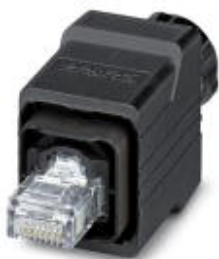
RJ45 connector, IP67, with push/pull interlocking, plastic housing, 1 Gbps, 8-pos., QUICKON fast connection technology, for 26 ... 24 AWG 1-wire and 7-wire conductors

Please be informed that the data shown in this PDF Document is generated from our Online Catalog. Please find the complete data in the user's documentation. Our General Terms of Use for Downloads are valid ( http://phoenixcontact.com/download )