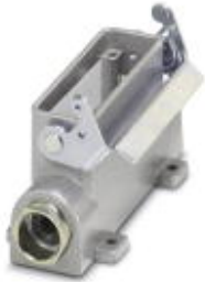
Box mounting base, with single locking latch, height 57 mm, with screw connection, 1x Pg21

Please be informed that the data shown in this PDF Document is generated from our Online Catalog. Please find the complete data in the user's documentation. Our General Terms of Use for Downloads are valid ( http://download.phoenixcontact.com )