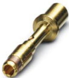
Crimp contact, turned, Single contact, contact diameter: 2 mm, crimp range: 4 mm 2 ... 4 mm 2

Please be informed that the data shown in this PDF Document is generated from our Online Catalog. Please find the complete data in the user's documentation. Our General Terms of Use for Downloads are valid ( http://phoenixcontact.com/download )