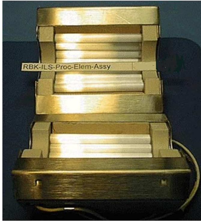
REPLACEMENT HEATING ELEMENT