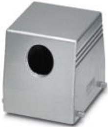
HEAVYCON sleeve housing D50, for double locking latch, height 76 mm, without support 1x M25, lateral conductor exit

Please be informed that the data shown in this PDF Document is generated from our Online Catalog. Please find the complete data in the user's documentation. Our General Terms of Use for Downloads are valid ( http://phoenixcontact.com/download )