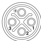
Pin assignment of M12 socket, 4-pos., S-coded, socket side view