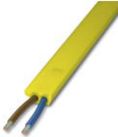
AS-Interface EPDM flat conductor in yellow, 2 x 1.5 mm 2 , 100 m ring

Please be informed that the data shown in this PDF Document is generated from our Online Catalog. Please find the complete data in the user's documentation. Our General Terms of Use for Downloads are valid ( http://download.phoenixcontact.com )