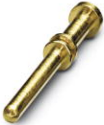
Crimp contact, turned, contact diameter: 2 mm, crimp range: 0.75 mm 2 ... 1.5 mm 2

Please be informed that the data shown in this PDF Document is generated from our Online Catalog. Please find the complete data in the user's documentation. Our General Terms of Use for Downloads are valid ( http://phoenixcontact.com/download )