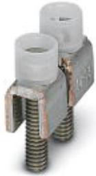
Fixed bridge, Number of positions: 2, Color: silver

Please be informed that the data shown in this PDF Document is generated from our Online Catalog. Please find the complete data in the user's documentation. Our General Terms of Use for Downloads are valid ( http://download.phoenixcontact.com )