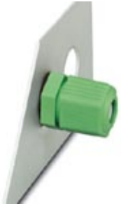
QUICKON panel feed-through, for the front wall assembly with 50 cm long wires, 3-pos.

Please be informed that the data shown in this PDF Document is generated from our Online Catalog. Please find the complete data in the user's documentation. Our General Terms of Use for Downloads are valid ( http://download.phoenixcontact.com )