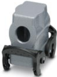
HEAVYCON sleeve housing B10, with double locking latch, height 72 mm, with thread 1x M20, lateral conductor exit

Please be informed that the data shown in this PDF Document is generated from our Online Catalog. Please find the complete data in the user's documentation. Our General Terms of Use for Downloads are valid ( http://phoenixcontact.com/download )