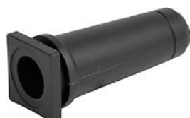
Cable Guard KT14 PVC Cable Guard for rewireable connectors