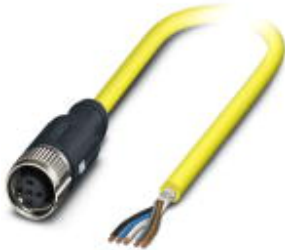
Sensor/Actuator cable, 5-position, PVC, yellow RAL 1021, shielded, free cable end, on Socket straight M12 SPEEDCON, A-coded, Cable length: 20 m

Please be informed that the data shown in this PDF Document is generated from our Online Catalog. Please find the complete data in the user's documentation. Our General Terms of Use for Downloads are valid ( http://phoenixcontact.com/download )