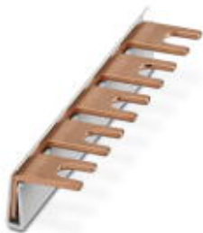
Wiring bridge for modules with connecting pitch 17.5 mm, 1-phase, 5-pos.

Please be informed that the data shown in this PDF Document is generated from our Online Catalog. Please find the complete data in the user's documentation. Our General Terms of Use for Downloads are valid ( http://phoenixcontact.com/download )