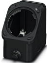
HEAVYCON EVO sleeve housing, plastic, with bayonet flange for EVO screw connection, B10, for single locking latch, height: 60.5 mm, without EVO screw connection

Please be informed that the data shown in this PDF Document is generated from our Online Catalog. Please find the complete data in the user's documentation. Our General Terms of Use for Downloads are valid ( http://download.phoenixcontact.com )