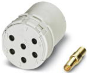
Contact insert, Number of positions: 6, Type of contact: Socket, Crimp connection

Please be informed that the data shown in this PDF Document is generated from our Online Catalog. Please find the complete data in the user's documentation. Our General Terms of Use for Downloads are valid ( http://phoenixcontact.com/download )