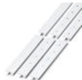
Zack marker strip, Strip, white, Unlabeled, Can be labeled with: Plotter, Mounting type: Snap into tall marker groove, For terminal block width: 12.2 mm, Lettering field: 12 x 10.5 mm

Zack marker strip - ZB 12:UNPRINTED - 0812120