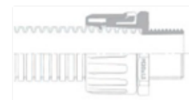
Conduit complete with FPA fitting